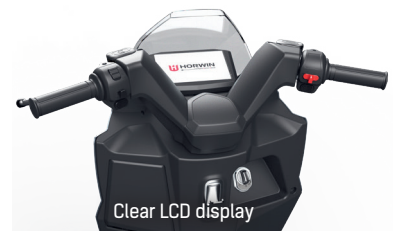
Clear LCD display

KEYLESS GO FULL LED-LIGHT HELMET STORAGE COMPARTMENT UNDER THE SEAT OPTIONALLY SECOND BATTERY TO DOUBLE RANGE (140 km)