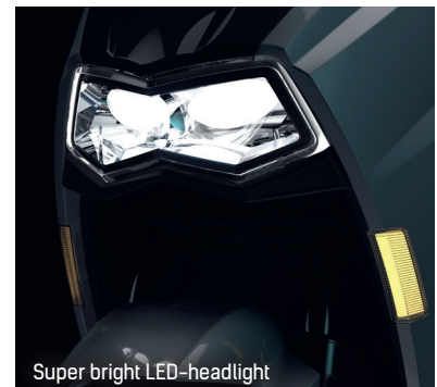
Super bright LED-headlight