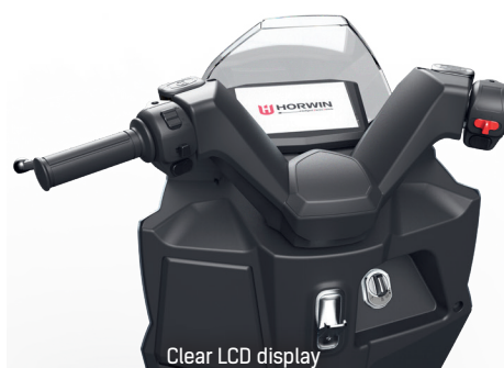
Clear LCD display